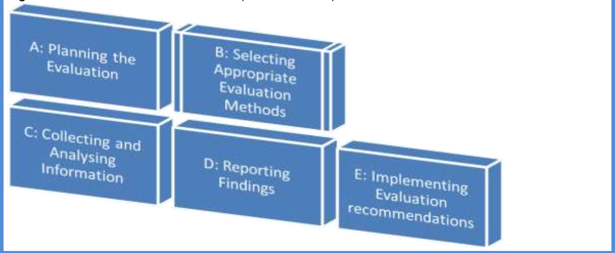
Figure 2: Guidelines for Evaluation (FIVE Phases)